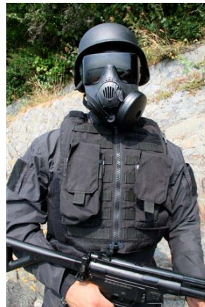
IBAS WITHOUT REFLECTIVE STRIPS