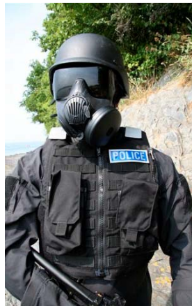
IBAS WITH REFLECTIVE STRIPS