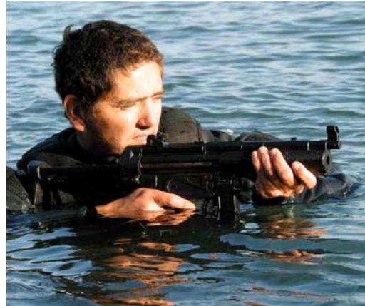
IBAS IN COVERT OPERATIONS

For example, all soft armour meets a minimum of American NIJ Standard IIIA. NIJ Level IIIA requires a maximum backface deformation of 44mm for a 9mm 8gm @ 4.26 m/s. Our armour gives a deformation of approx 7mm and with our standard armour piercing plate, there is virtually no deformation.