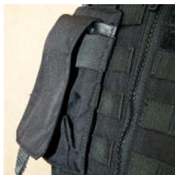
Four detachable & expandable pockets included